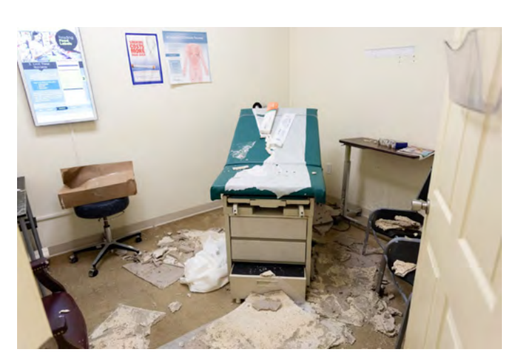
Avicenna Free Clinic in Panama City, Florida, suffered major damage from Hurricane Michael.

Together, we <u>surveyed 450+ frontline clinic staff</u> in 47 U.S. states and territories, finding 81% of clinic staff experienced climaterelated disruptions within the past three years. To respond, we introduced a new doctrine on patient-centered climate action, published in JAMA, to catalyze health sector and policy action and published first-ever resources to help. The <u>Climate Resilient</u> <u>Health Clinics Toolkit</u> has reached 2500 clinic providers and staff in a pioneering effort that is catalyzing support from others in the pharmaceutical sector.